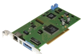
ZHW/InES PCI Ethernet Card

Hirschmann™ has been working intensively with the Institute for Embedded Systems at the Zurich University of Applied Sciences (ZHAW) in Winterthur for several years. As part of this cooperation, ZHAW offers support in implementing PTP Ordinary Clocks to interested users. This includes software stacks and VHDL designs based on the technology developed by Hirschmann™, as well as additional services such as evaluation kits, training and design support. More detailed information can be found at http://ines.zhaw.ch .